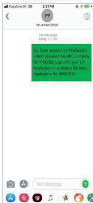
Block request SMS to investor